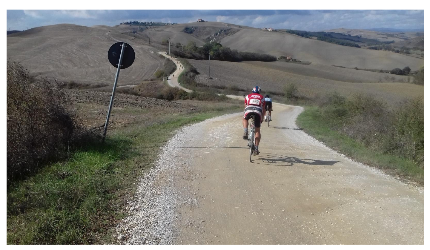
The descents were very dangerous and arms shoulders back and neck took a battering. Corners were very scary.