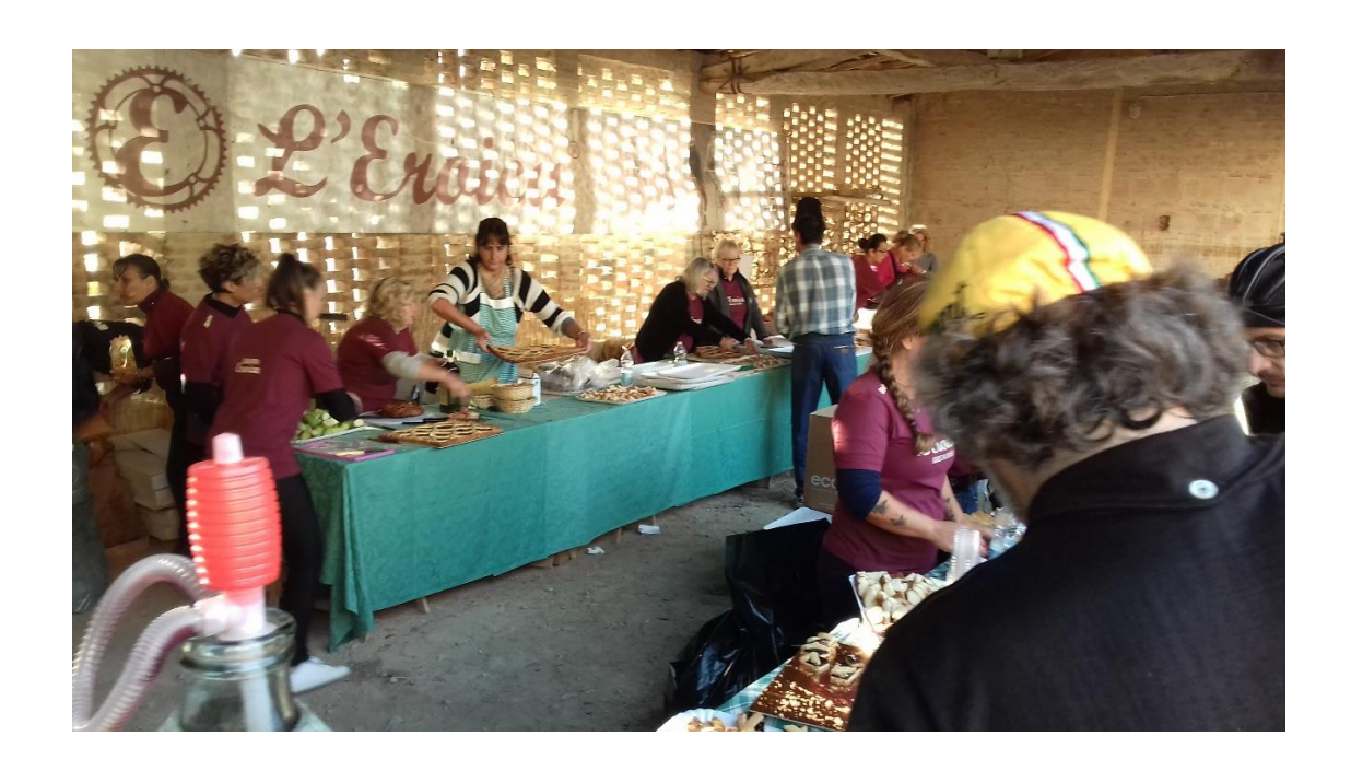
Leaving Bounconvento for Asciano.