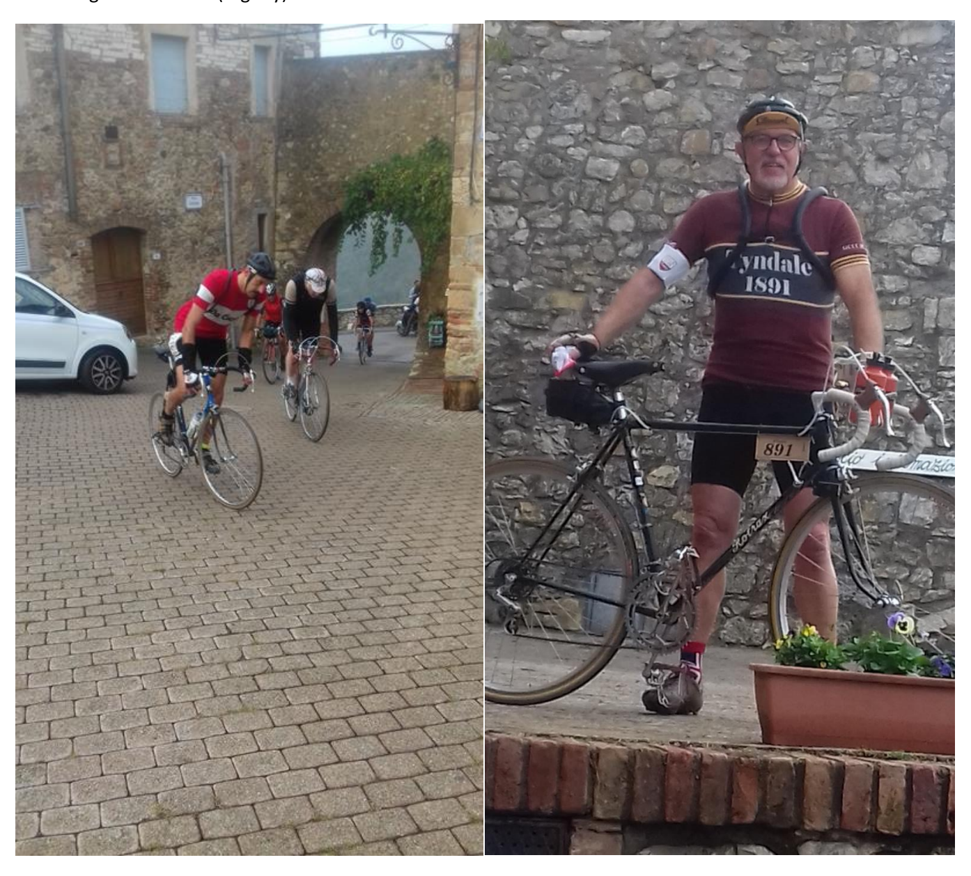
Castle Murlo 2nd feedstaion was at Buonconvento at 70k. More italian specialities and vino.