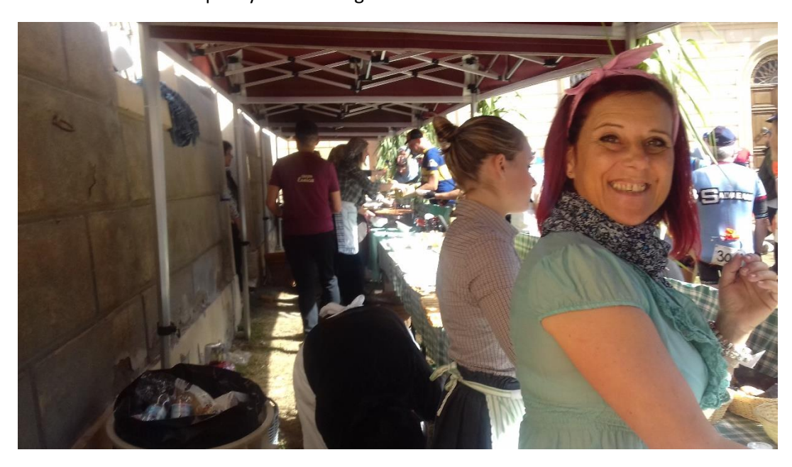
Classic shot or riders on route to Monte Saint Marie.